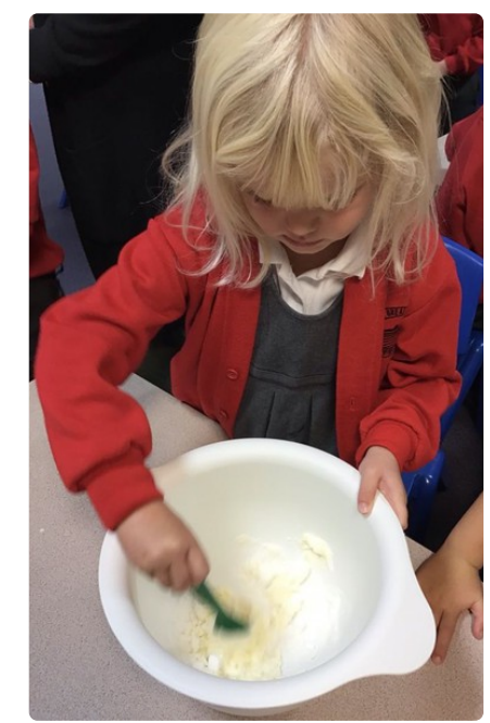
Year 1 work on their cooking skills!

Across the school we are working on 'learning more and remembering more'. Each week, Class 3 reflect on their learning by recapping the knowledge that has 'stuck'. Here is last week's 'sticky knowledge'.