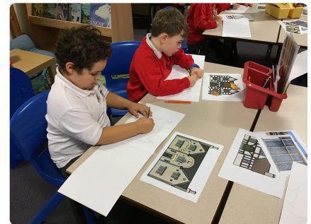
Year 1 Artists