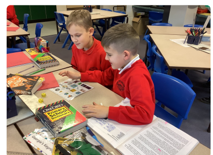
Using 'Learning Grids'