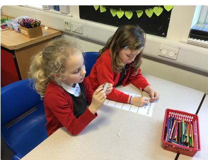
Paired work in Year 2

We have inspiring art and DT projects to look forward to as well this half term, so keep an eye on the school newsletter and we will share some pictures of our finished projects with you soon.