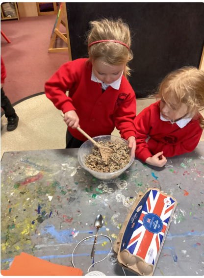
Reception making bird feeders