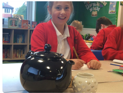
Still Life Art