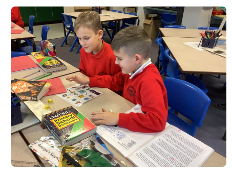
Using 'Learning Grids'