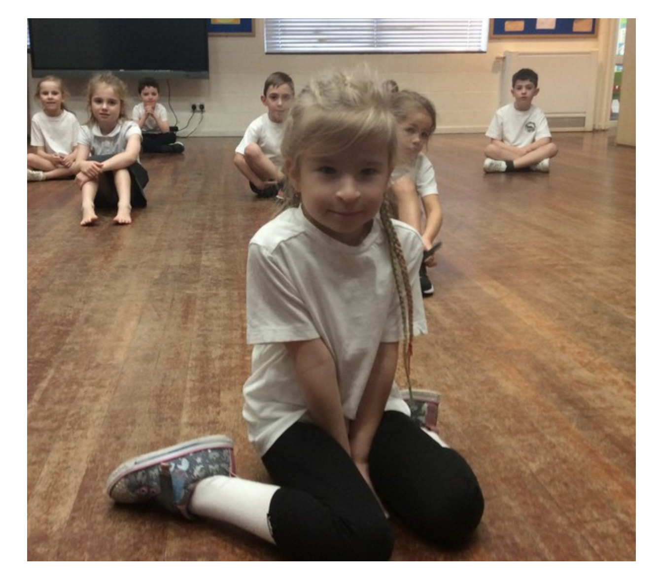
This Term's Learning

A new term brings exciting new learning. Here is a little taster of what we will be learning this term.