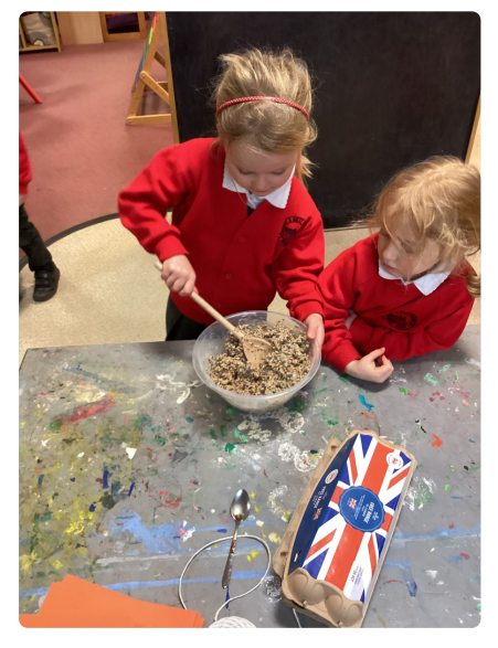
Reception making bird feeders