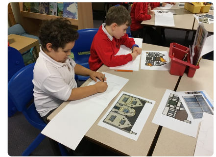
Year 1 Artists