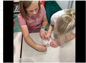
Year 5 making sedimentary and metamorphic rock- using chocolate!