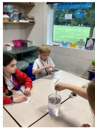
Year 5 investigating rocks