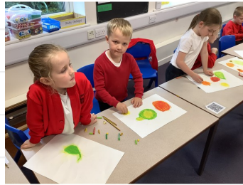
Year 2's amazing art