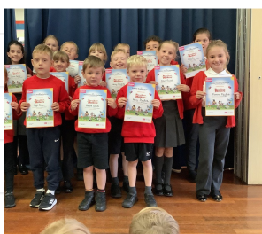
Some of the children with their certificates

Congratulations to the many children who participated in the 2024 summer reading challenge- Marvellous Makers. This week the children were presented with their certificates. It is great to see so many children supporting the libraries and enjoying reading- well done!