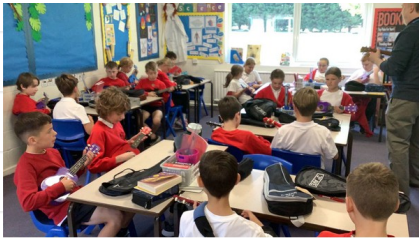
Year 6 learning the ukulele