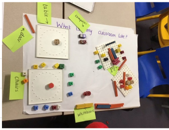
Active geography in Year 1 making plans of their classroom