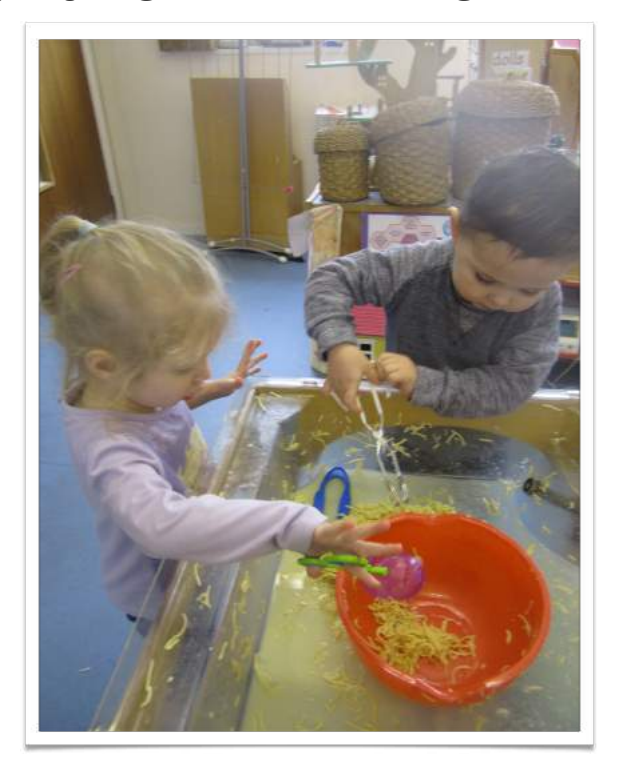
Engrossed in original, innovative and exciting activities "Look wiggly worms"