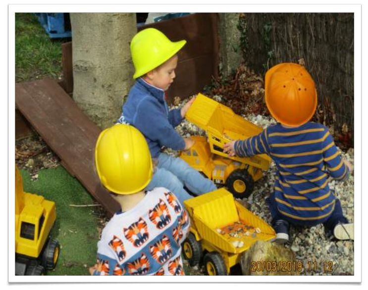
Co-operating and collaboration with learning partners

"Staff have extremely high expectations for all children at the setting." Ofsted 2020